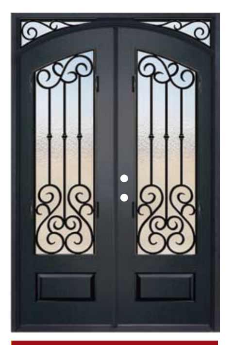
AUGUSTA IC9178DD-T Glass: Arctic