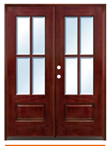
TDL AM78204DD Glass: Low-E Clear Bevels