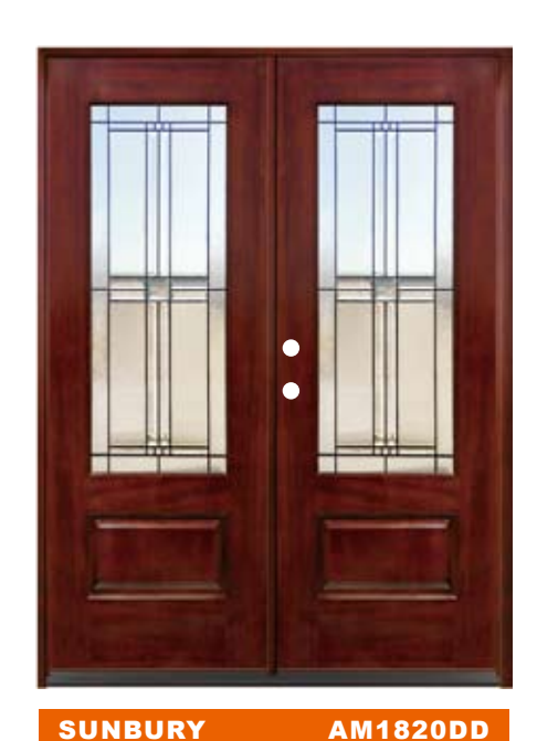
SDL Glass: Low-E Clear Privacy Rating: 1

Glass: Decorative with Patina Caming Privacy Rating: 7