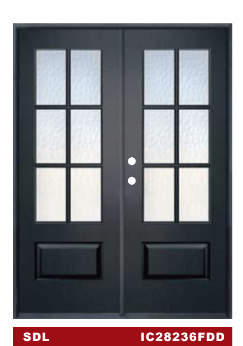
Glass: Flemish Privacy Rating: 7