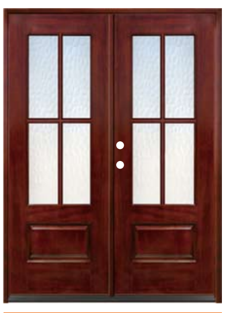
Glass: Low-E Clear Privacy Rating: 1