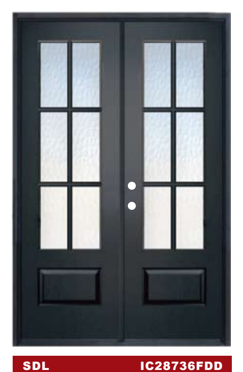
Glass: Flemish Privacy Rating: 7