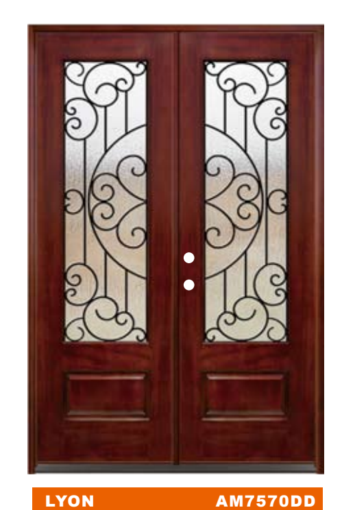
LYON AM757 Glass: Rain with Internal Grille Privacy Rating: 9