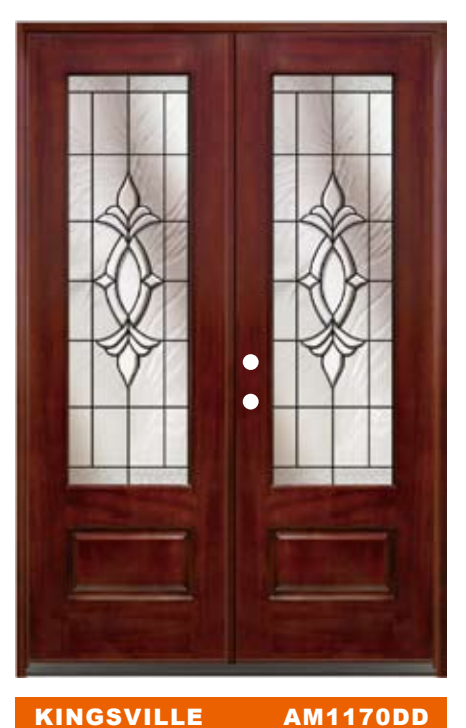
KINGSVILLEAM1170Glass: Decorative with Patina CamingPrivacy Rating: 6