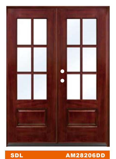
SDL Glass: Low-E Clear Privacy Rating: 1