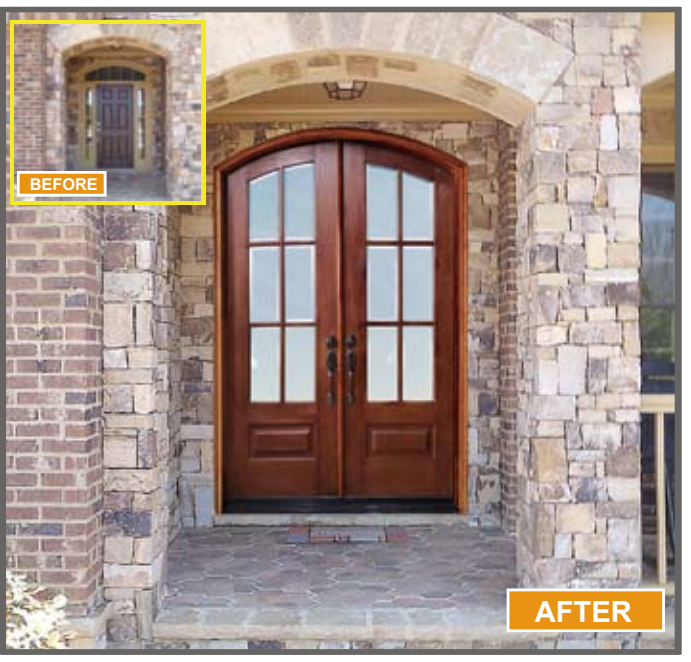
Custom Arch Top Double Door

MaxCraft Doors, Inc. 2222 Northmont Parkway, Suite 200 Duluth, GA 30096 770-623-8819 www.maxcraftdoors.com