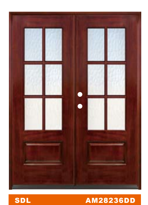
Glass Option 1: Arctic (AM28236ADD) Privacy Rating: 9 Glass Option 2: Flemish (AM28236FDD) Privacy Rating: 7