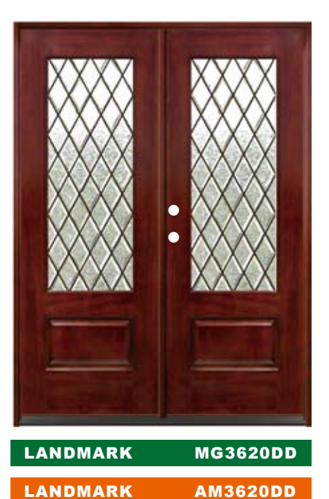
Glass: Decorative with Patina Caming Privacy Rating: 8