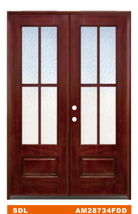
Glass: Low-E Clear Bevels Privacy Rating: 1