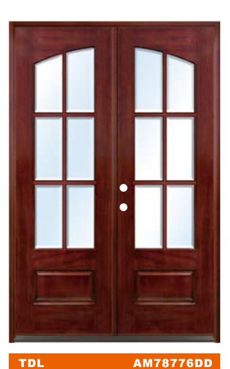
Glass: Low-E Clear Bevels Privacy Rating: 1