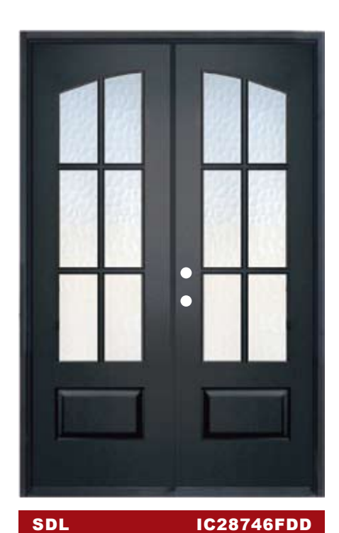
Glass: Flemish Privacy Rating: 7